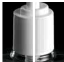
24-415 (smooth or ribbed)