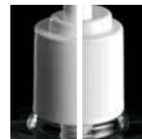
28-415 (smooth or ribbed)