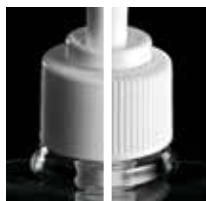
24-410 (smooth or ribbed)