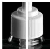
28-410 (smooth or ribbed)