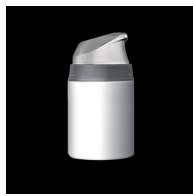
50, 75, 100 ml