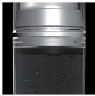
48 mm (snap-on)