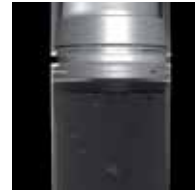
32 mm (snap-on)