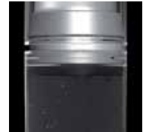
48 mm (snap-on)